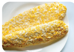
Breaded Pangasius Fillet