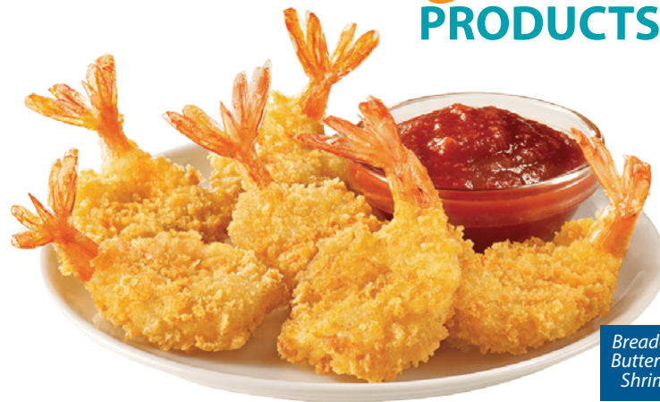
Breaded Butterfly Shrimp