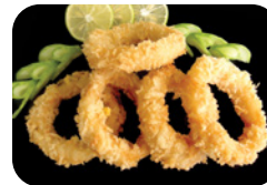
Breaded Squid Ring