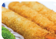
Breaded Torpedo Shrimp