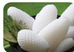
Pine cone Cuttlefish